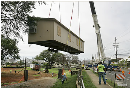
Hawaii Modular Space delivered modular buildings yesterday to temporarily replace a UH Lab School building that was destroyed by fire.